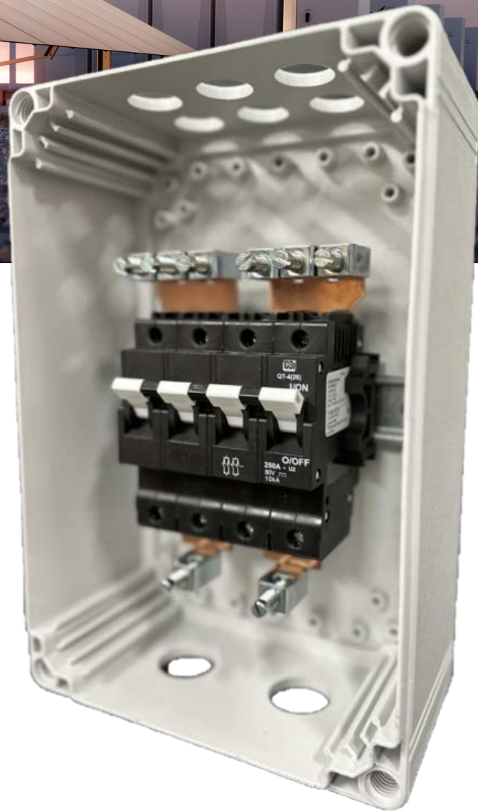
Emcomp Battery Box, Item No EBB2104-7

This hydraulic magnetic circuit breaker sets a new standard in Renewable Energy and ensures that the batteries in the installation are protected and disconnected in the safest possible manner. The unit contains both poles in the same box and is available with a rated current of up to 500A.